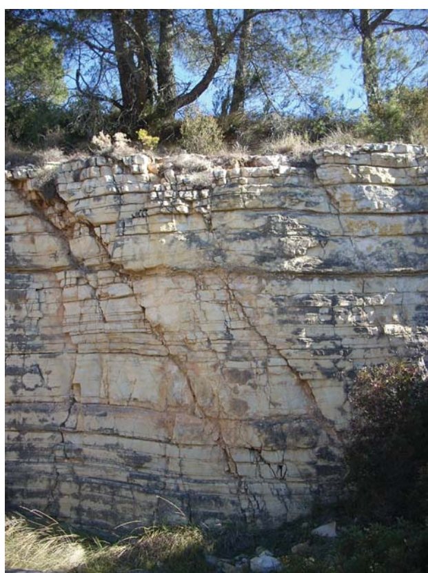
Fig. 2. Two examples of the strong bedding of Alcover stone outcrops. A: millimetric/centimetric and B: decimetric bedding

the quarries have demonstrated the Roman presence at least during the 1 st -2 nd centuries AD. 5