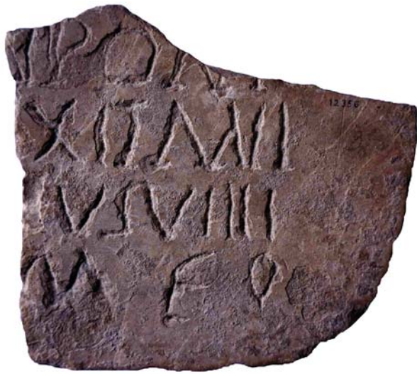
Fig. 7. Slab with an epitaph from the 4 th -5 th centuries (CIL II2/14, 1603)

parallelepiped blocks, a kind of support that previously only stones similar to El Mèdol were capable of providing. As previously noted, archaeology does not offer evidence of when the Alcover quarries were abandoned, but one can have some confidence that their stone was gradually replaced by Santa Tecla and other minor local limestones - among them the so-called “llisós” - until its total disappearance from the epigraphic record. 22