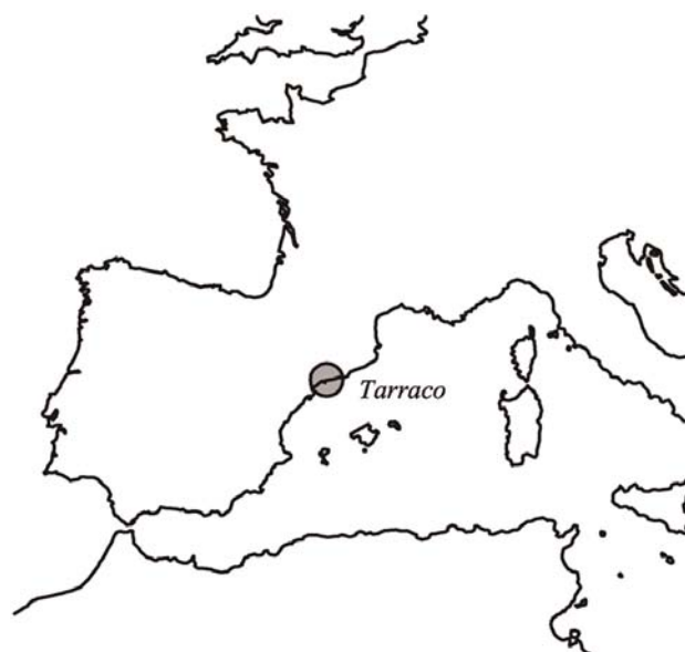
Fig. 1. Tarraco in the western Mediterranean context

Updating of the recently re-edited epigraphic corpus 1 is a key element in a multidisciplinary project aiming at understanding the stones used for the inscriptions of Tarraco (Hispania Tarraconensis). 2 After a study of Santa Tecla