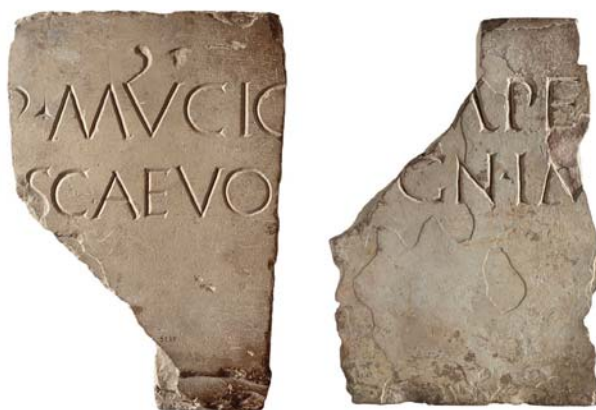
Fig. 6. Opisthographic inscription from Tarraco (CIL II/2/14, 991-988)

This preference for Alcover stone in elite epigraphy contrasts clearly with the use of other local limestones, among them El Mèdol stone, which was mostly used for structural purposes. For instance, El Mèdol stone appears in funerary buildings and in parallelepiped blocks that contain private epitaphs. 17 These monuments belonged mainly to ordinary people, freeborn people, freedmen and slaves. According to the palaeography, onomastics and formulae, they date from the first century BC to the