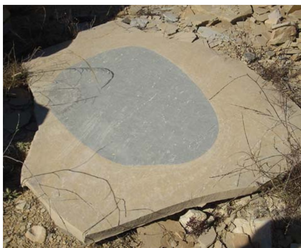
Fig. 3. Alcover stone slabs in different colours: A: beige red (due to fire) (CIL II2/14, 977), B: beige (CIL II2/14, 1270) and C: a case of combination of two tones in the same slab