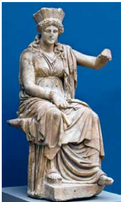
Fig. 5. Cybele Turrita , identified with Rhea, wearing a mural crown: circa 60 BCE, Glyptotek Museum, Copenhagen, no. 1617. Cf. Fig. 6.

Сл. 5. Кибела Турита, идентификована као Реа са назубљеном круном: circa 60 г.п.н.е, Глипотока у Копенхагену, бр. 1617. Cf. Сл. 6.