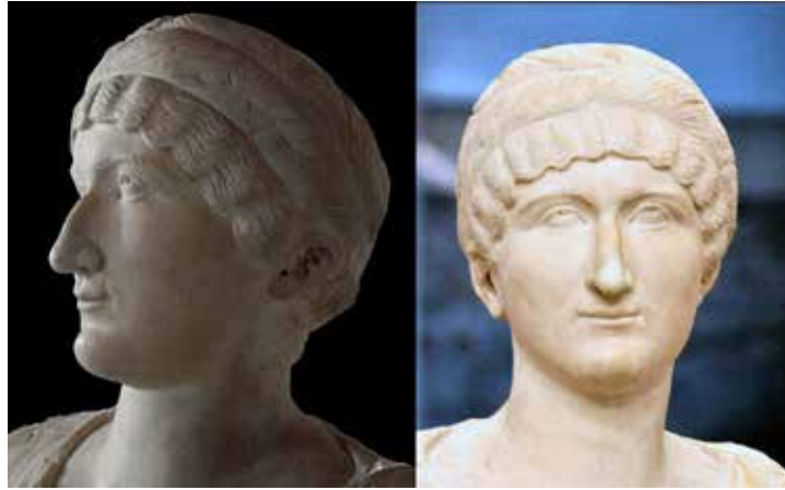
Fig. 2. Portrait head of Helena Augusta, Capitoline Museum, Rome, Sala degli Imperatori. Her eyes are raised and her mouth suggests a smile, perhaps intended to convey pious contentment and in line with the 'heavenly gaze' evident on portraits of her son and his caesars and remarked on by Constantine's biographer Eusebius, Vita Constantini , 4.15.1.

Сл. 2. Портрет Јелене Августе, Музеј Капитола, Рим, сала императора. Њене очи су подигнуте, израз лица са благим осмехом, наговештавајући евентуално и рајску атмосферу како је примећено од Константиновог биографа Јевсевија ( Vita Constantini , 4.15.1).