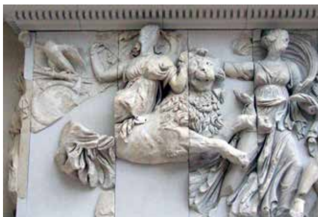
Fig. 3. Rhea-Cybele rides her lion, 1: Pergamon altar, circa 170BCE, Staatliche Museen, Berlin.

Сл. 3. Реја- Кибела на лаву, 1: Пергамски олтар, circa 170 п.н.е, Државни музеји (Берлин).