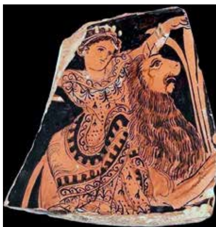
Fig. 4. Rhea-Cybele rides her lion, 2: Attic red-figure vase, late fifth-century BCE, kylix fragment, Boston, Mass., Museum of Fine Arts, 10.187

Whatever their statues' true origin, Constantine's honouring of Tyche and Rhea, each with their own temples opposite each other in the Tetrastôn, 'preserved [Rhea's] ancient status as "mother of the gods" amongst the Byzantines