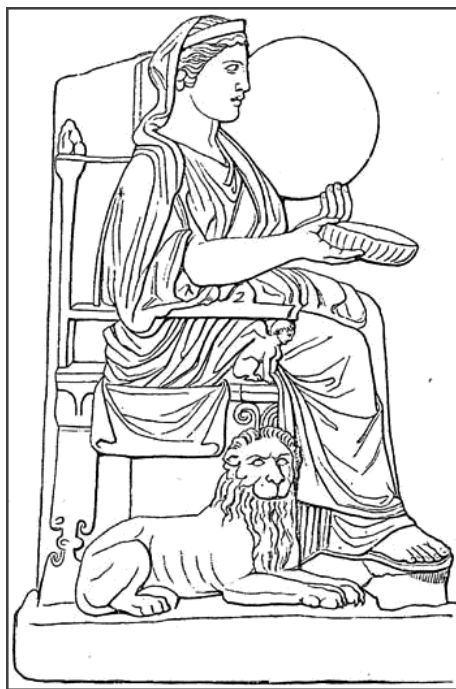
Fig. 6. Cybele with her attributes: in her left hand a frame drum, in her right an ancestor of the tambourine, at her side a lion. Illustration from Meyers Konversations-Lexikon (Leipzig, Bibliographisches Institut, 1888).

Сл. 5. Кибела Турита, идентификована као Реа са назубљеном круном: circa 60 г.п.н.е, Глипотока у Копенхагену, бр. 1617. Cf. Сл. 6.