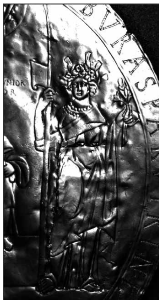
Fig. 8. A Tyche wearing flowers: Depiction of a Tyche (perhaps personifying Constantinople, though Zaccagnino prefers Carthage) holding flowers and wearing a floral version of a turreted crown. Margin of a presentation dish photographed by G. Bevan and A. Gabov for C. Zaccagnino, 'The missorium of Ardaburius Aspar: new considerations in its archaeological and historical contexts', Archaeologia Classica 63 (2012), pp. 419-54, p. 427, Fig. 7.

Сл. 8. Тихе са цвећем: Представа Тихе (можда као персонификација Цариграда, иако је Заканињо идентификовао Картагину) како држи цвеће и носи круну украшену цвећем. Илустрација преузета из: G. Bevan and A. Gabov for C. Zaccagnino, 'The missorium of Ardaburius Aspar: new considerations in its archaeological and historical contexts', Archaeologia Classica 63 (2012), стране. 419-54, страна. 427, Сл. 7.