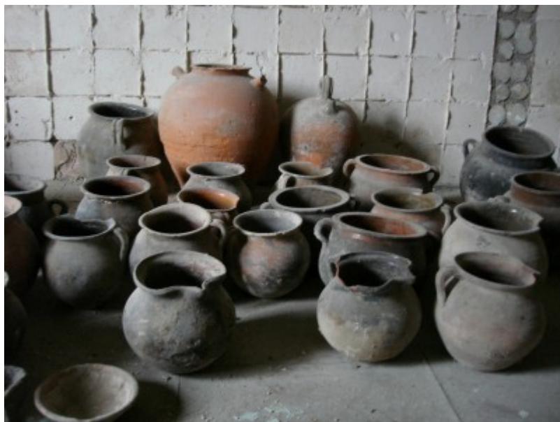
Pottery sample from the historical building “Casa de la Convalescència” in Vic, Barcelona.

Specifically, this thesis considered ceramics with brown decorations of iron and manganese, with particular attention to ceramics of the type à taches noires from the Provençal site of Jouques and common ware from the archaeological works made in the historical building “Casa de Convalescència” in Vic (Barcelona).